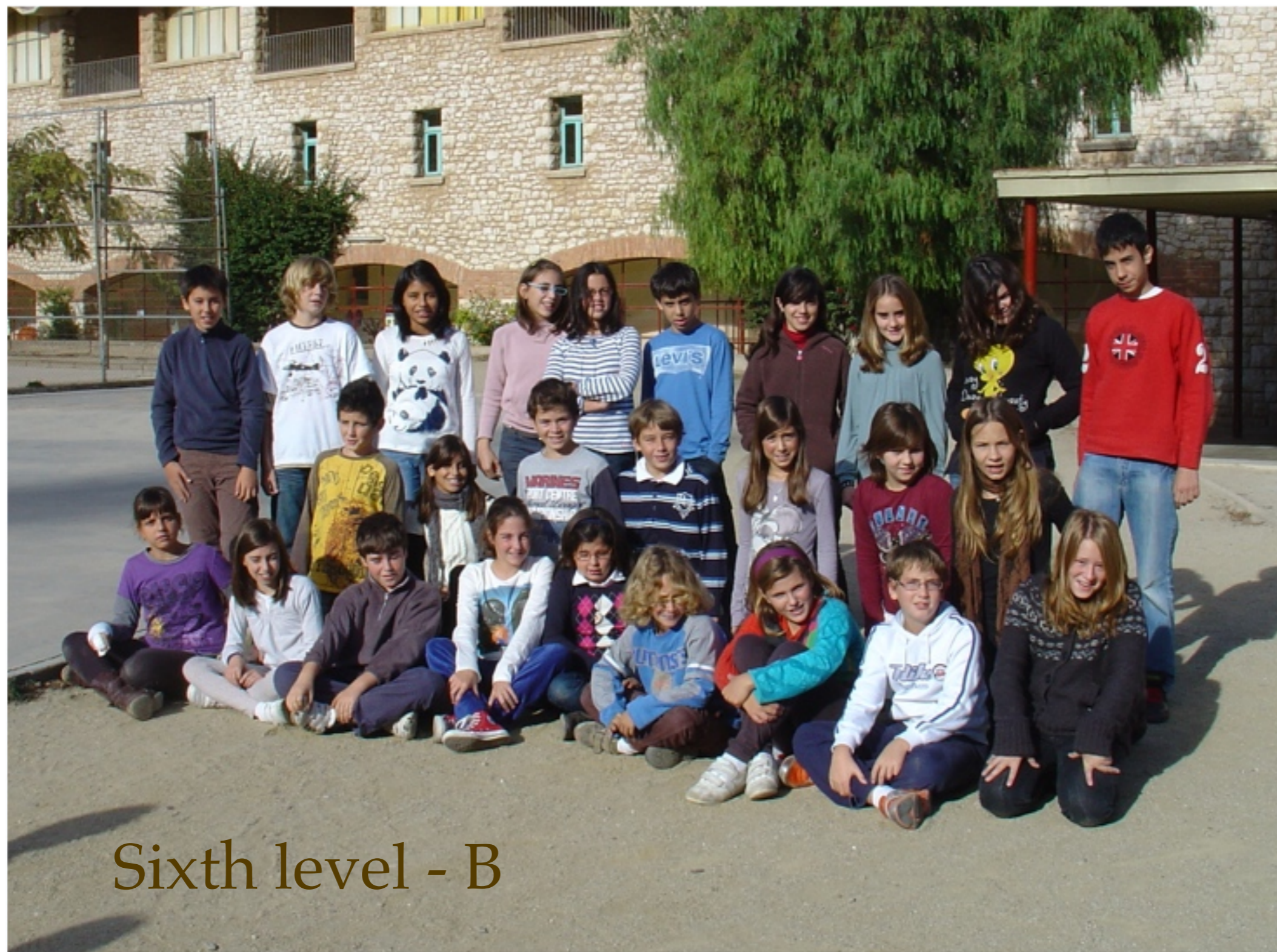
Sixth level - B