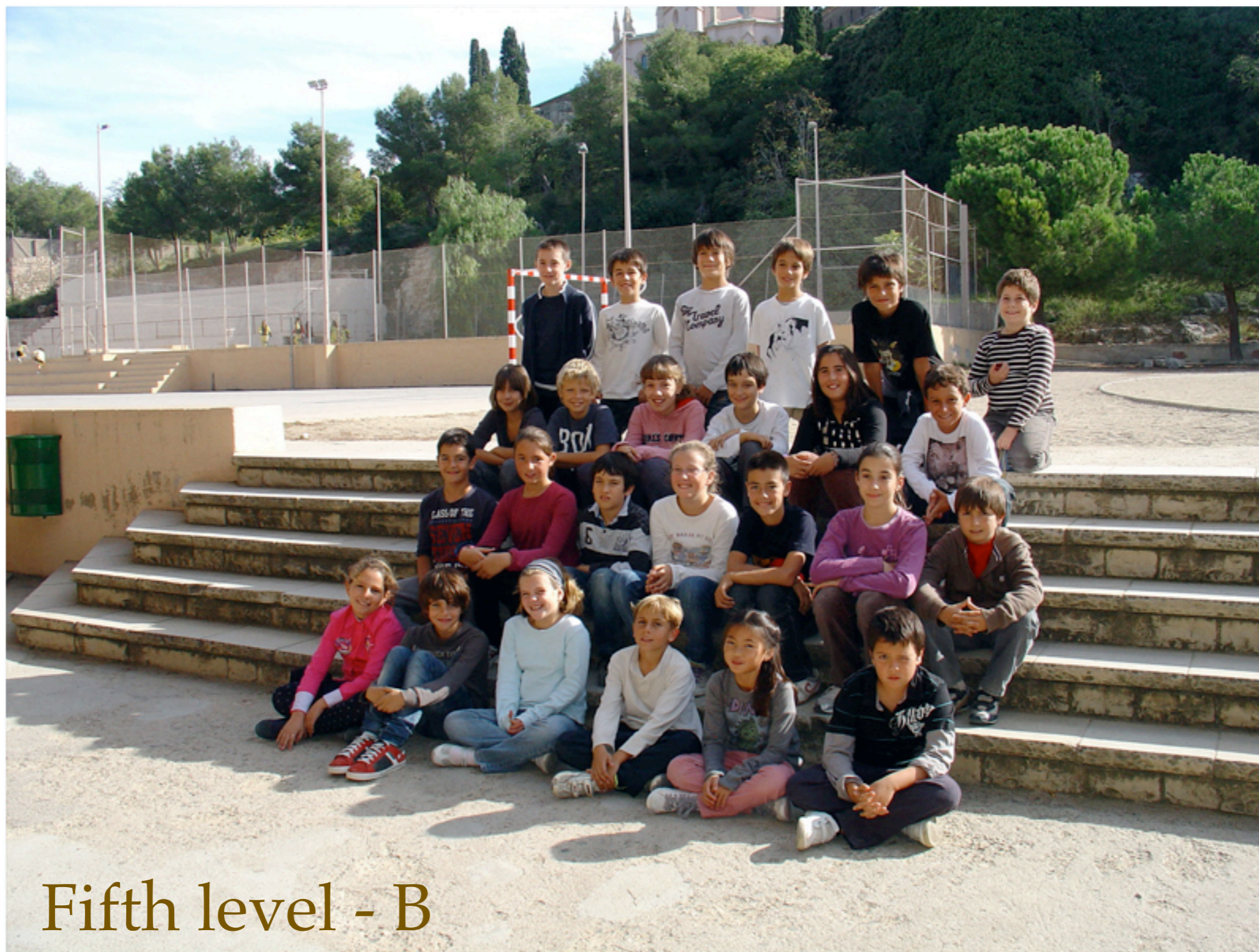
Fifth level - B